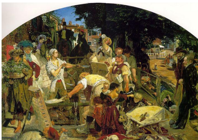
Ford Madox Brown, detail Work, 1852-65, oil on canvas, (Manchester City Art Galleries)

The tackling of the suffering of the working class doesn’t mention only by novels, but also different painting at that time represents these conditions. For instance, the Victorian London drawn by Ford Madox Brown represents this issue.