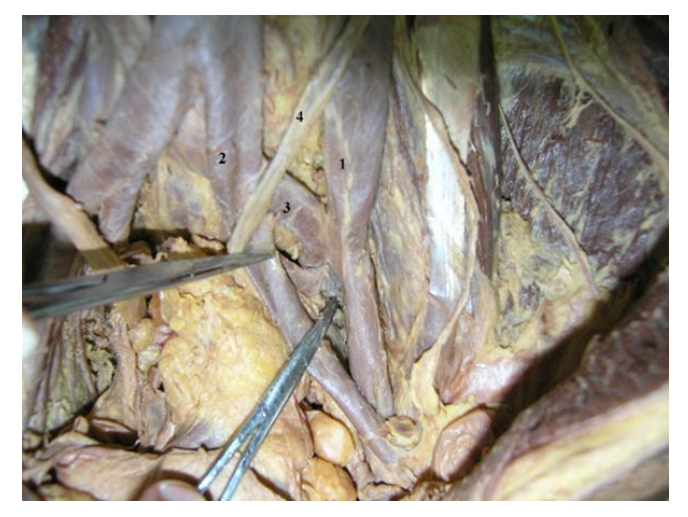
Figure 2: Showing the origin of the left IVC (1) dorsal to the left common iliac artery (pulled medially) (2). The left common iliac vein (3) and the left ureter (4) also shown.